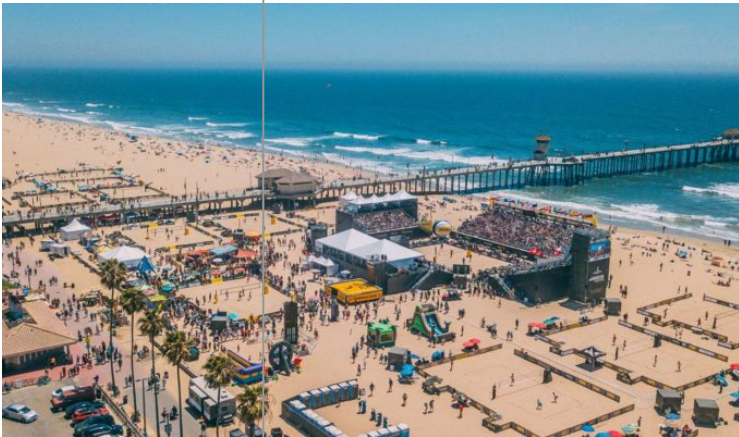
( https://www.asianjournal.com/usa/california/this-virus-doesnt-take-the-weekends-off-newsom-officially-shuts-down-orange-county-beaches/ ).