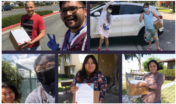
( https://www.asianjournal.com/usa/datetime-usa/historic-filipinotown-group-activates-nationwide-care-program-for-working-families/ ).