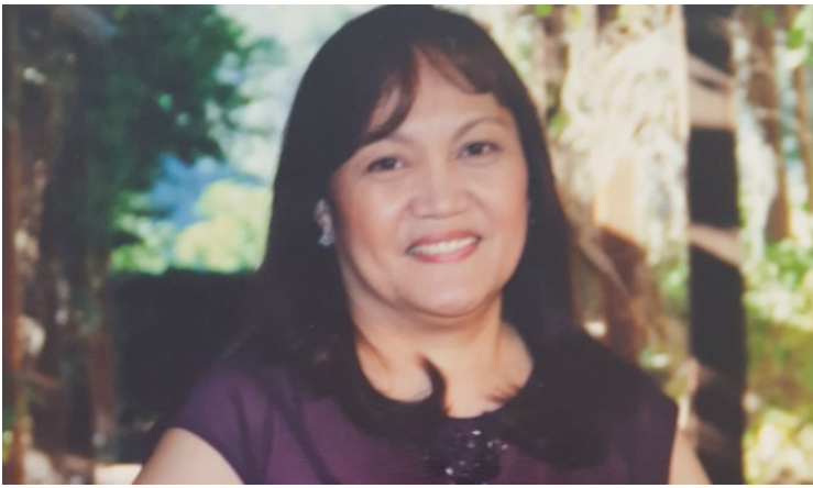
( https://www.asianjournal.com/usa/southerncaliforniawith-only-a-surgical-mask-on-the-front-lines-filipina-nurse-dies-at-hollywood-area-hospital/ ).